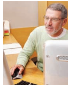
Printed by Metex